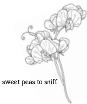
sweet peas to sniff

The seeds themselves may not look like much but remember its about the possibilities of what they become...here are some ideas.