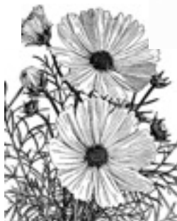
cosmos to remind us of the stars