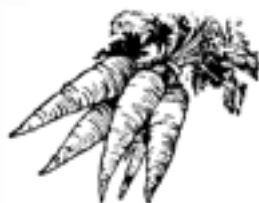
carrots to eat