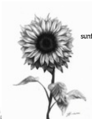
sunflowers to reach to the sky